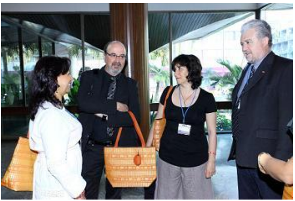
Participants with the Thai Silk Conference bag

The On the Move for Equality conference did provide the space and opportunity for participants to share and contribute to a forum, the outcomes of which will inform El's work on gender in the years to come. It will provide a basis for discussion at the 6th World Congress, to be held in Cape Town, South Africa, in July 2011, with consideration of the resolution on Gender Equality providing the starting point for the development of an El Global Action Plan " On the Move for Equality ", aimed at setting the priorities and main areas of action for the next quadrennium period.