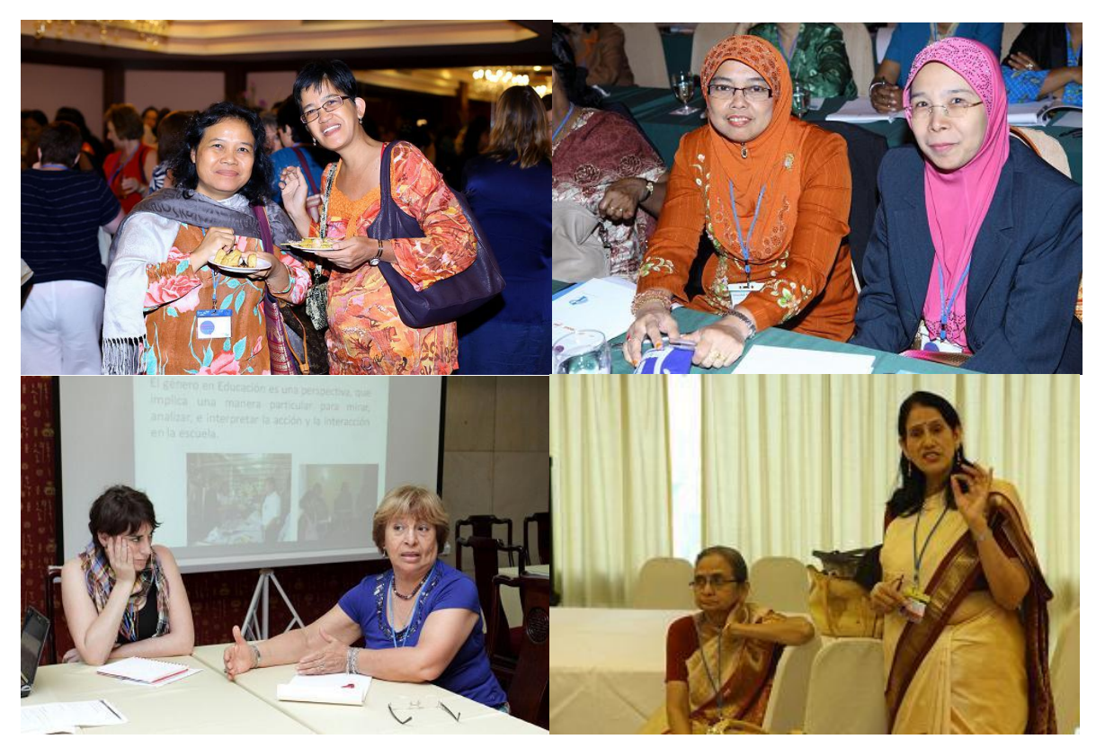
Participants during the opening reception and workshops