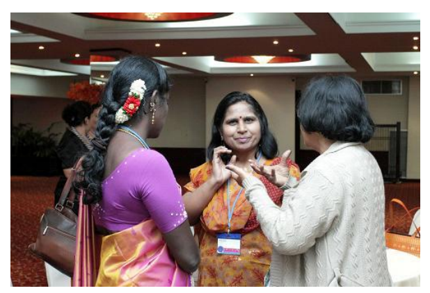
Participants discussing during workshop break

This report outlines the discussions and outcomes of this ground-breaking event. The first chapter describes the concept of the Conference; the second chapter shows the main outcome of a resolution on gender equality for consideration by El's 6<sup>th</sup> World Congress in July 2011; later chapters provide some detail on the discussions of the plenary and workshop sessions,, and the last chapter gives an overview of participants' evaluation of the Conference.