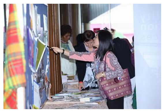
Participant looking at exhibition material

One other space for member organisations to share their experiences and inspiration for their activities was the Exhibition area, which gave the participants the opportunity to display materials of their unions' activities and campaigns. Fifteen tables and ten notice boards overflowed with leaflets, brochures, t-shirts, stickers, buttons, banners, posters and photos of gender equality campaigns, actions and research performed by EI and its member organisations and its networks. The UN Girls' Education Initiative and UNESCO also provided publications, quickly collected by the participants.