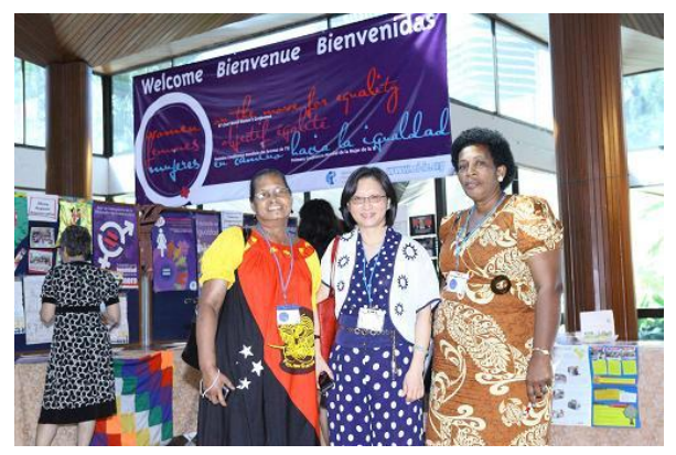
Participants in the exhibition space

Nearly half of the 49 participants from Africa were members of the Africa Women's Education Network (AWEN). The Asia-Pacific region, the most populous and diverse region amongst EI regions, was represented by 170 participants, almost a third of whom were members of one of the subregional networks, ASEAN, SAARC or COPE. European EI member organisations participated in the Conference with 89, a third of these participants being active in the ETUCE Women's Network. The North America and Caribbean region was represented by 33 participants, five of whom came from the Caribbean Union of Teachers Status of Women Committee. Almost all of the 21participants from Latin America were members of the Education Workers Women's Network; the Middle East and North Africa region was represented by six participants.