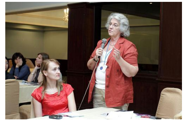
Discussions in the network meetings

It is clear that the financial crisis and economic recession has significantly impacted the provision of quality education in many places, and has served to set-back the pace of change for equality. Also clear from participants is the impact of the food security and climate change crises on achieving equality and quality education for all throughout life.