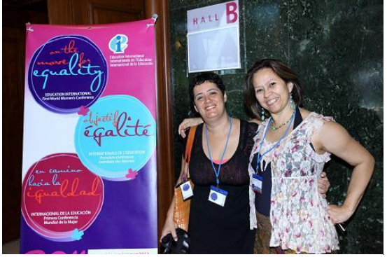
Participants next to the Conference banner in front of the plenary hall