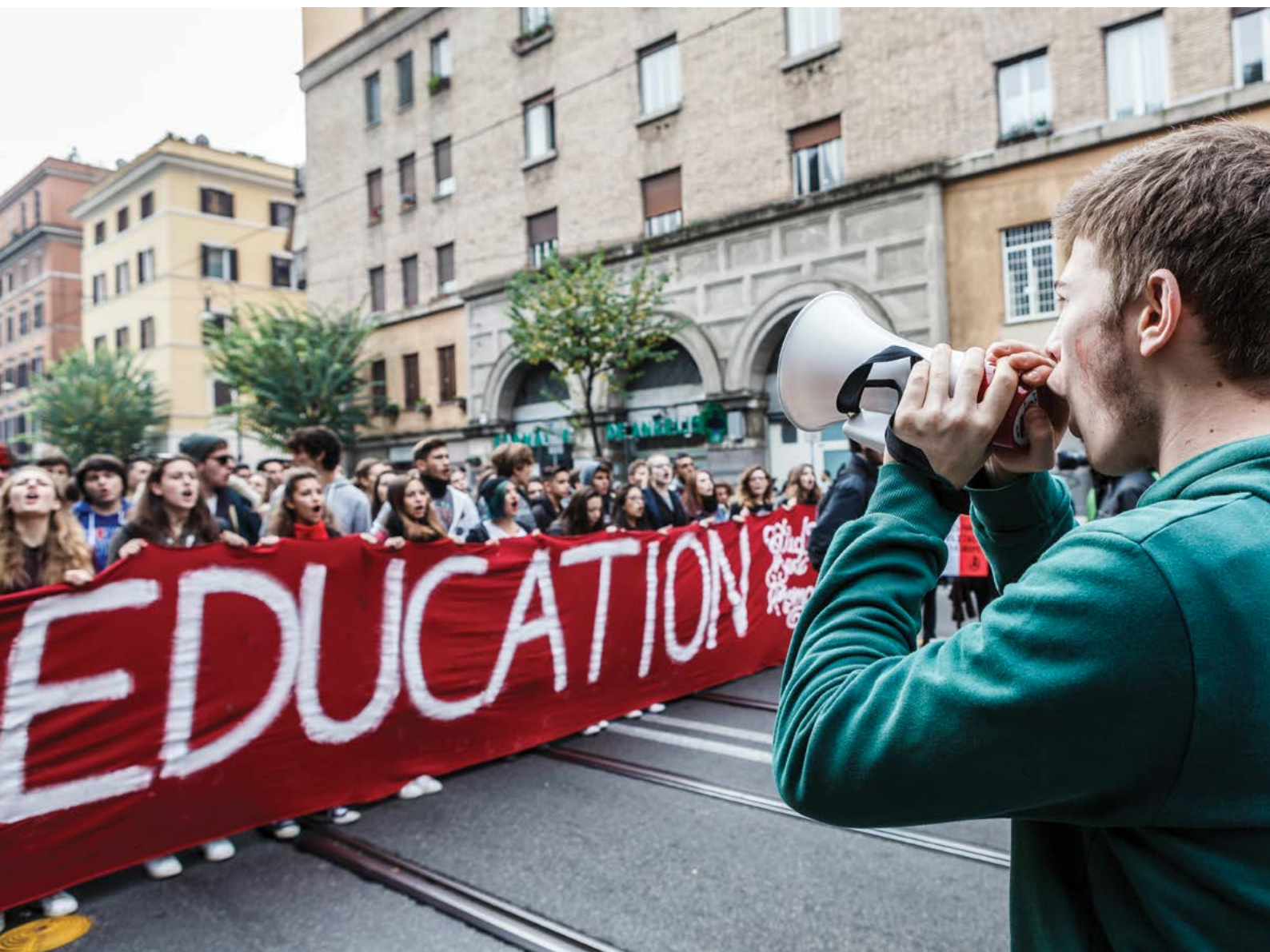
Photo: Italy, Rome, November 2015